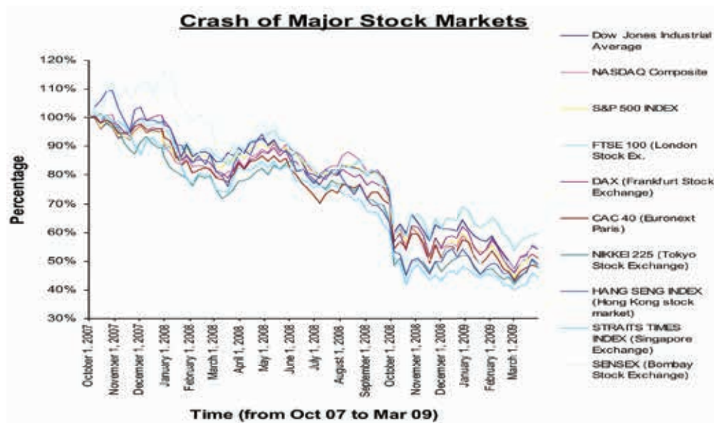
Figure 1: Crash of Major Stock Markets during Global Financial Meltdown.

Data retrieved from finance.yahoo.com on 25th March 2014