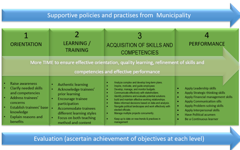
Figure 1: Isabirye’s Conceptual Framework.

To establish the effectiveness of the leadership learning interventions for the local municipality to achieve their desired goals and objectives, Isabirye’s adapted conceptual framework is relevant. According to Explorance (2023), effective training interventions are implemented in four phases, namely: Orientation, Learning, Skills Acquisition, and Performance phases. If the intervention must achieve its objectives, Isabirye (2015) argues that it must be supported by the policies, resources, and practices of the organisation; and each of the phases must be evaluated. Furthermore, ample time must be allowed to ensure that effective orientation, training, and refinement of competencies for effective performance are realised. This is reflected in Figure 1.