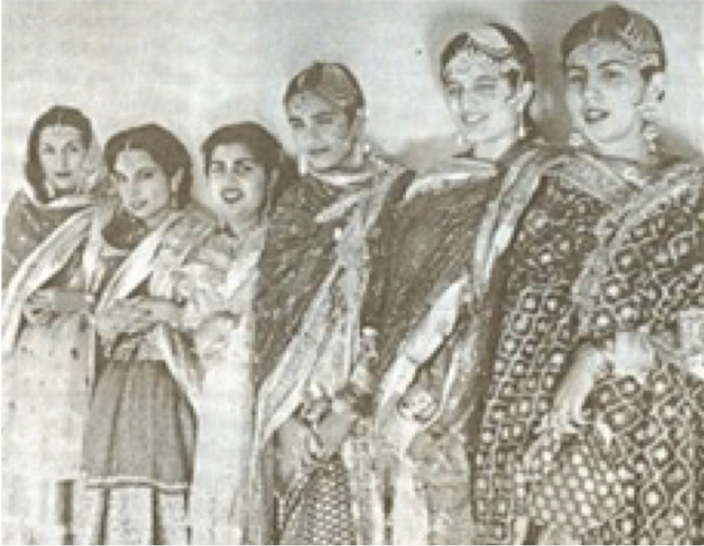
Figure 2: Traditional Fashion Silhouette, gharara & sharara after partition