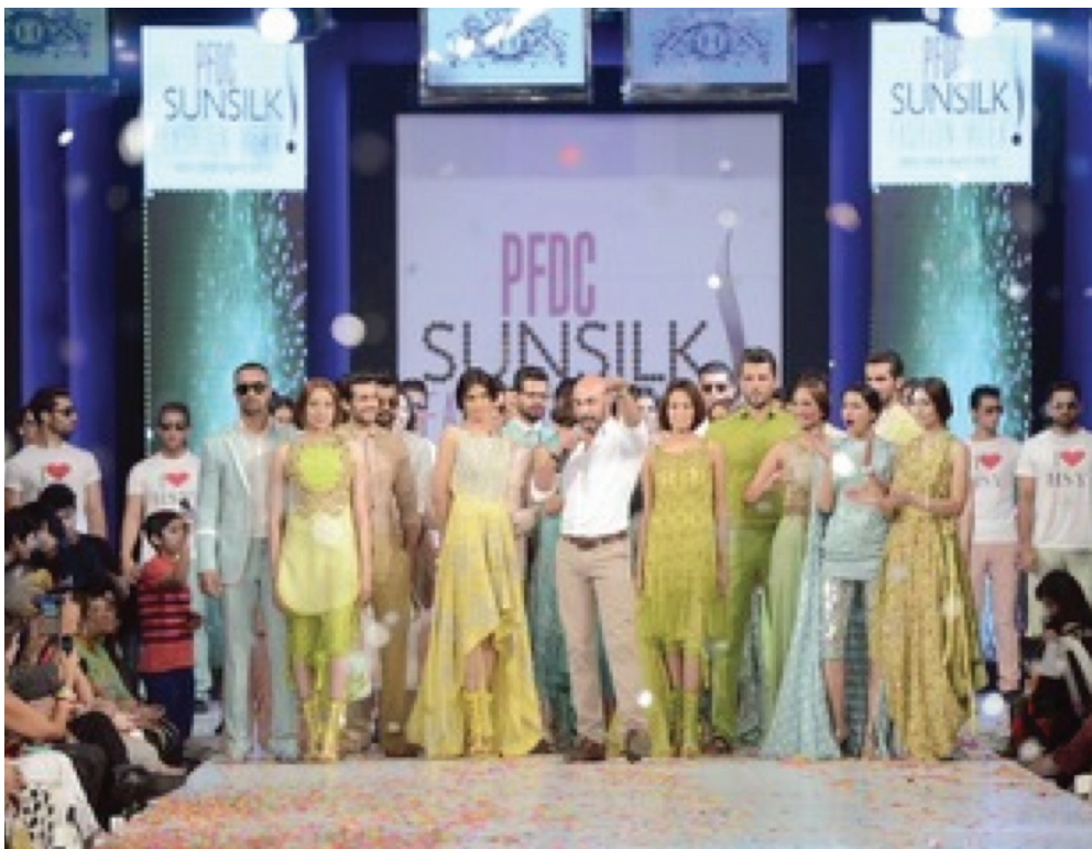
Figure 3: Pakistani designer at a fashion show organized by PFDC

PFDC, with its head office in Lahore, is representing and promoting Pakistani designers at all levels, both domestically and internationally. Regular fashion weeks has been started since February 2010 (PFDC, 2014) to celebrate Pakistani designers in international fashion week circuits in collaboration with multinational corporations like Unilever and L'Oreal. Since its inception, they have successfully held five fashion weeks and two bridal weeks (refer to Figure 4.) attracting high profile international buyers and media. As a result, in September 2011, eight designers from Pakistan were invited to hold the exclusive show at the prestigious Federation Francoise du Prêt, a Porter Feminine in Paris (PFDC, 2014). They have also signed an MOU with World Fashion Organizations and World Fashion Week to become an official representative in Pakistan. Pakistan has always been known for embroideries and PFDC collaborated with Aik Hunar Aik Nagar (AHAN) for the revival of the craft sector by merging traditional embroideries with contemporary designs (Ajmal, 2018). In the arena of retail, they have a Multi-brand outlet with 9,500 square feet at a mall in Lahore stocking 40 designers, another franchised in India. One of the remarkable efforts is the launch of The PFDC Fashion Active (TPFA), a unique retail concept at Mall One in Lahore on February 26, 2016. It's not a