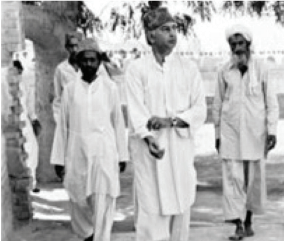
Figure 3: Zulfikar Ali Bhutto wearing shalwar kameez