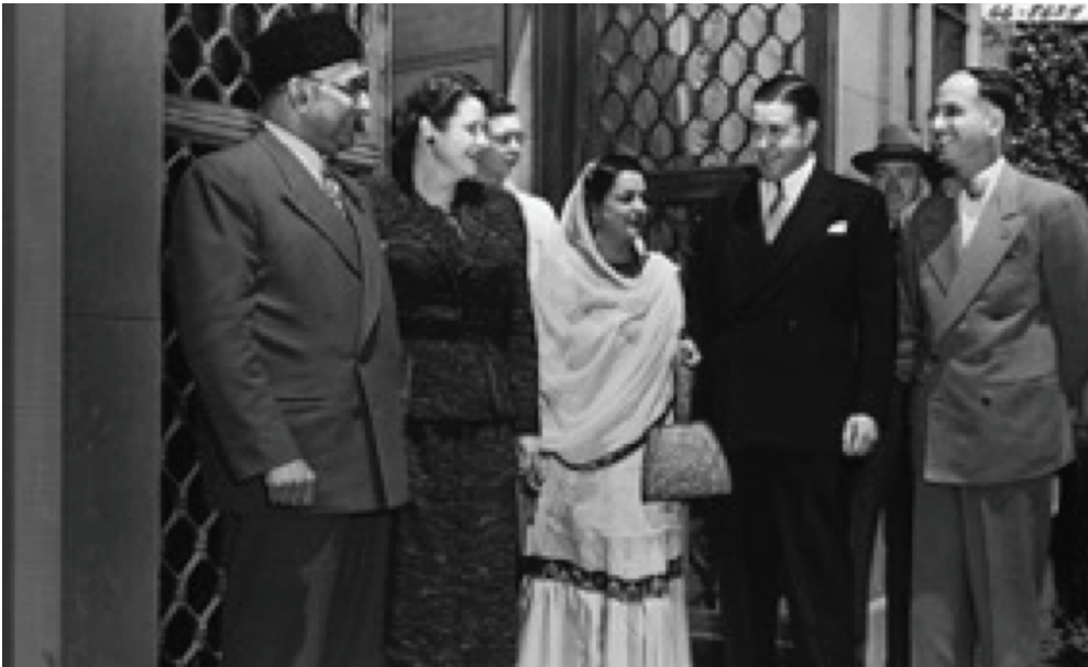
Figure 1: Pakistan First Lady Begum Rana Liaquat Ali Khan wearing traditional clothes at a political convention

Ready to wear can be divided into two categories, prêt a porter and fast fashion. Both target large clientele with affordable prices. Particularly fast fashion requires unique challenges of predicting a trend, planning quantities and inventories for production of quality apparel at affordable prices, following a consumer-based approach (Gabrielli, Baghi, & Codeluppi, 2013).